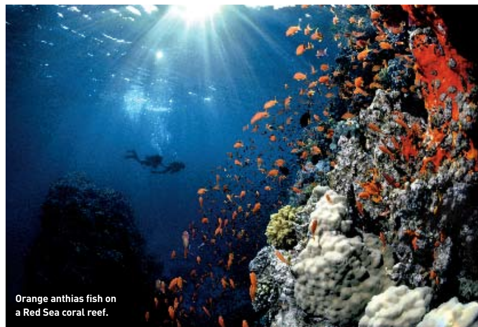
Orange anthias fish on a Red Sea coral reef.

Your aim should be to capture the essence of the creatures you are trying to photograph. Understand their lives and habits and look them in the eye. It sounds like a cliché, but you really can tell if a photograph has been taken by someone who is emotionally detached or unsympathetic towards an animal.