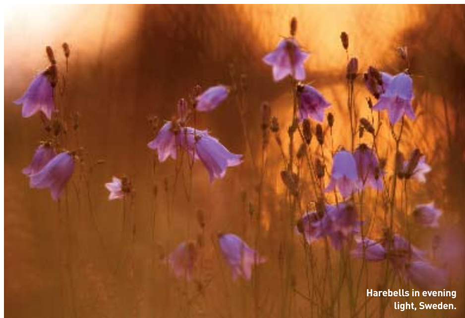
Harebells in evening light, Sweden.