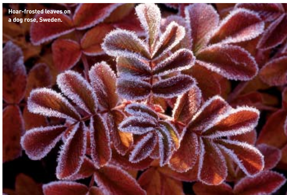
Hoar-frosted leaves on a dog rose, Sweden.

Understanding colour is important in plant photography. Primary colours (red, blue and yellow) have the greatest visual impact, but mixing these with certain secondary colours (eg red-green, blue-orange or yellow-purple) can make each hue even more intense. Contrasting colours add a feeling of depth – warm colours appear to advance while cool colours recede.