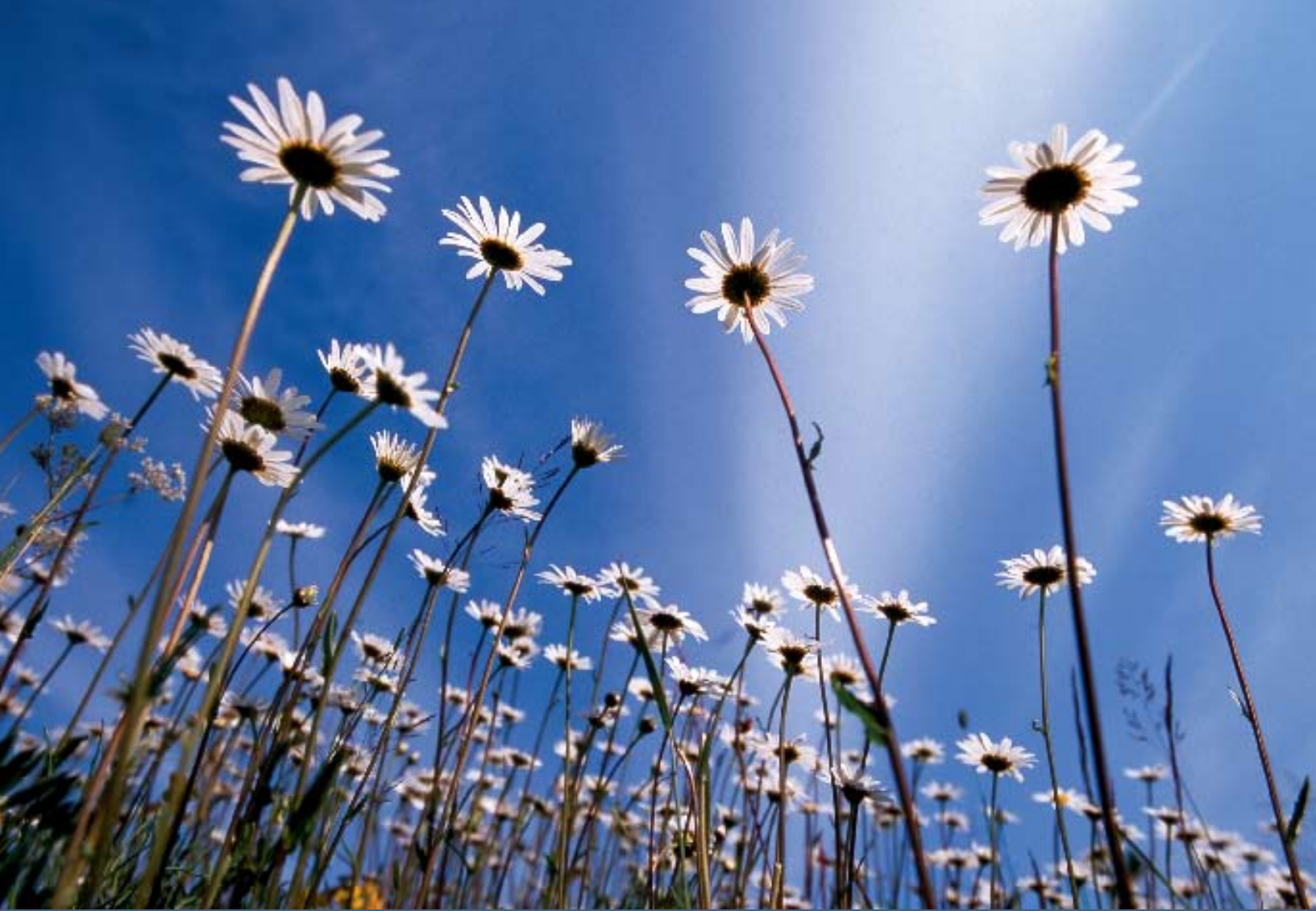
PHOTO MASTERCLASS PART THREE PLANT PORTRAITS