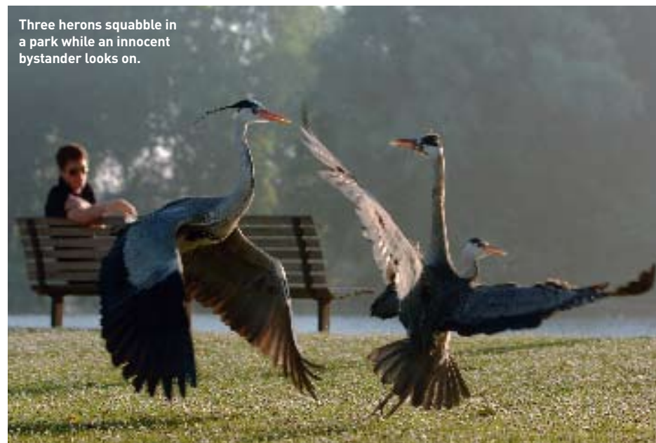
Three herons squabble in a park while an innocent bystander looks on.

There are many excellent books on wildlife gardening that provide plenty of good advice, but there are four golden rules – grow endemic plants, put out feeders, don't be too tidy and never use pesticides. If you have the space, it's also worth building a simple pond – it will pay dividends in photo opportunities.