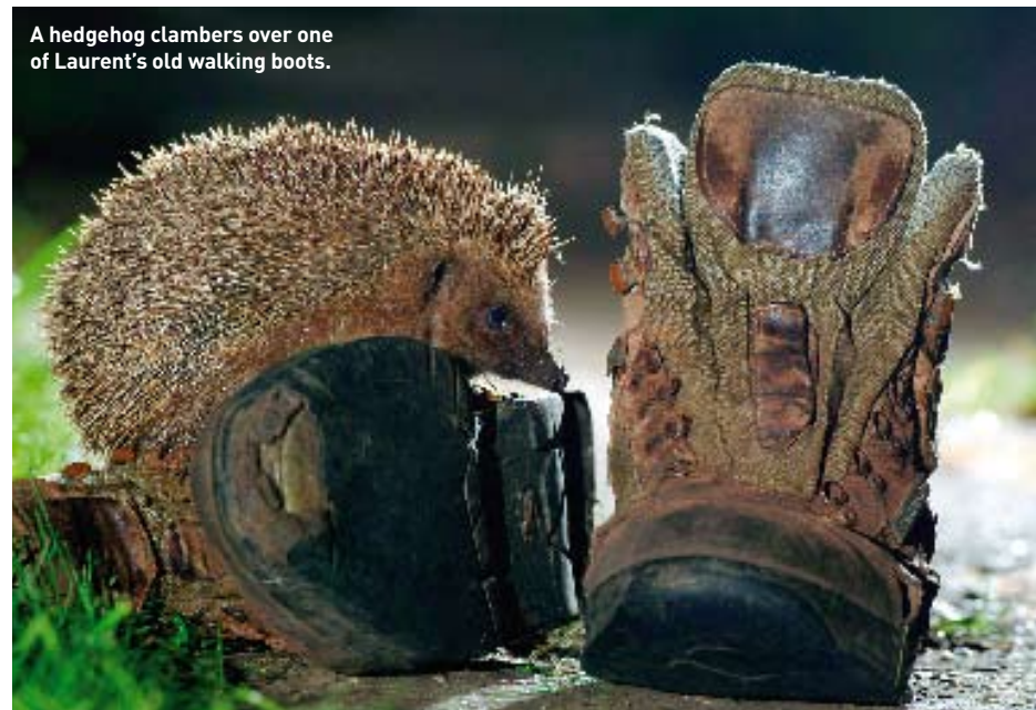
A hedgehog clammers over one of Laurent's old walking boots.