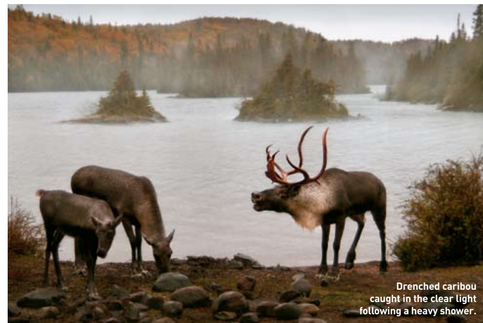
Drenched caribou caught in the clear light following a heavy shower.

Too many photographers get caught up in the modern-day obsession with cameras. But camera equipment is far less important than we are led to believe. Many professionals occasionally go back to basics and dumb down their equipment specifically to focus on the art of wildlife photography rather than the technique – often with remarkable results.